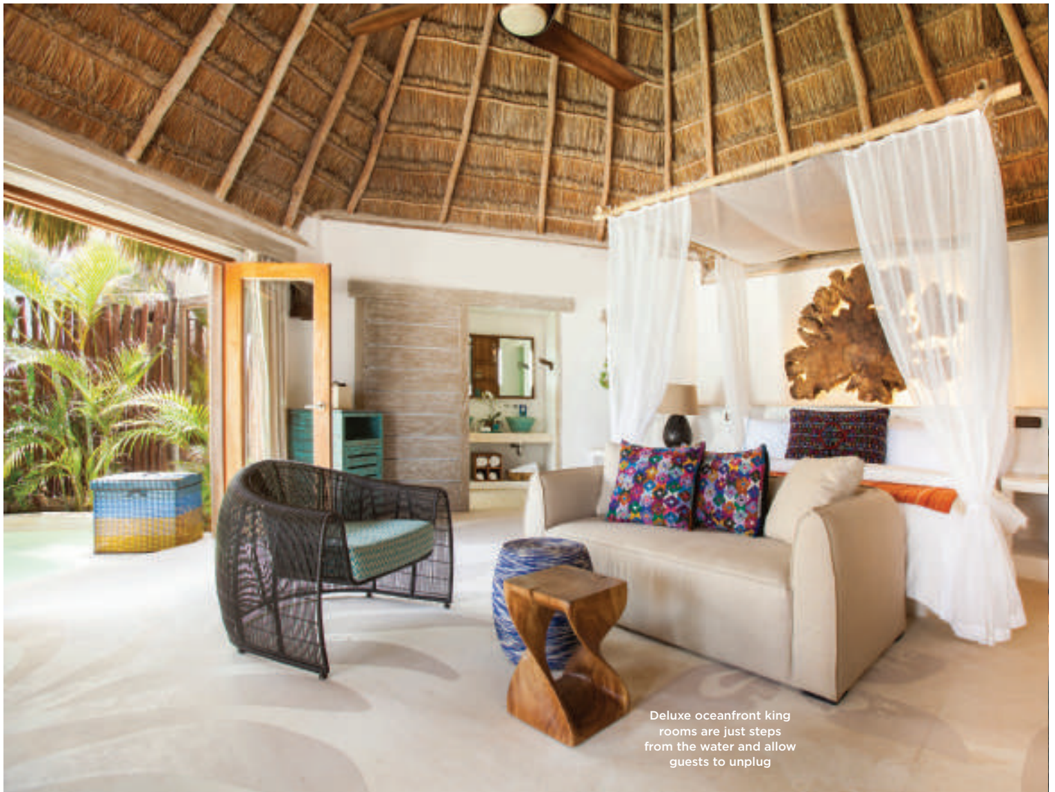
Deluxe oceanfront king rooms are just steps from the water and allow guests to unplug