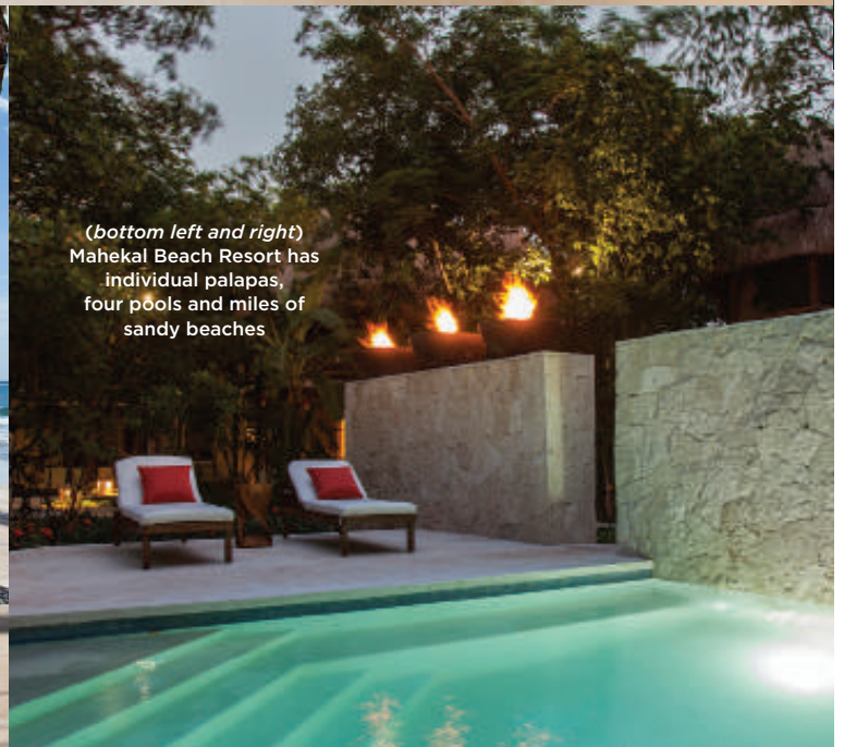
(bottom left and right) Mahekal Beach Resort has individual palapas, four pools and miles of sandy beaches