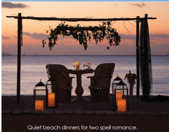
Quiet beach dinners for two spell romance.