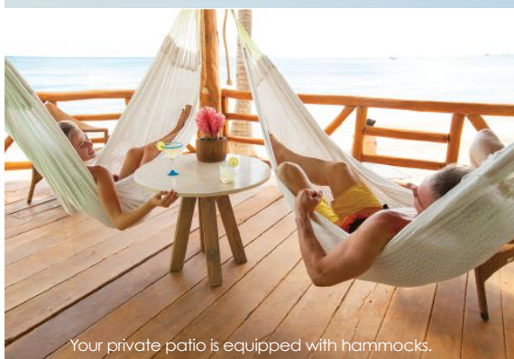
Your private patio is equipped with hammocks.