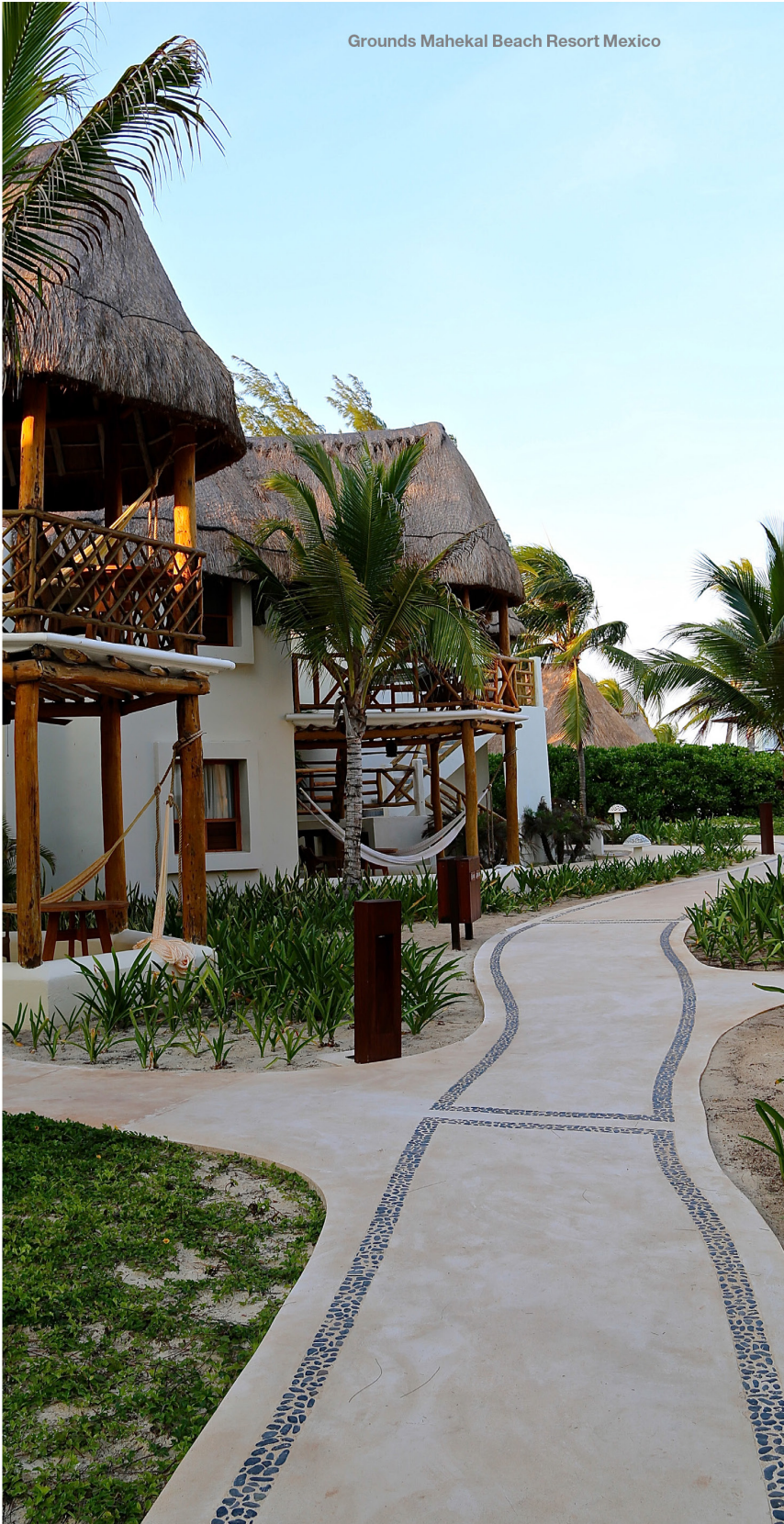
Grounds Mahekal Beach Resort Mexico