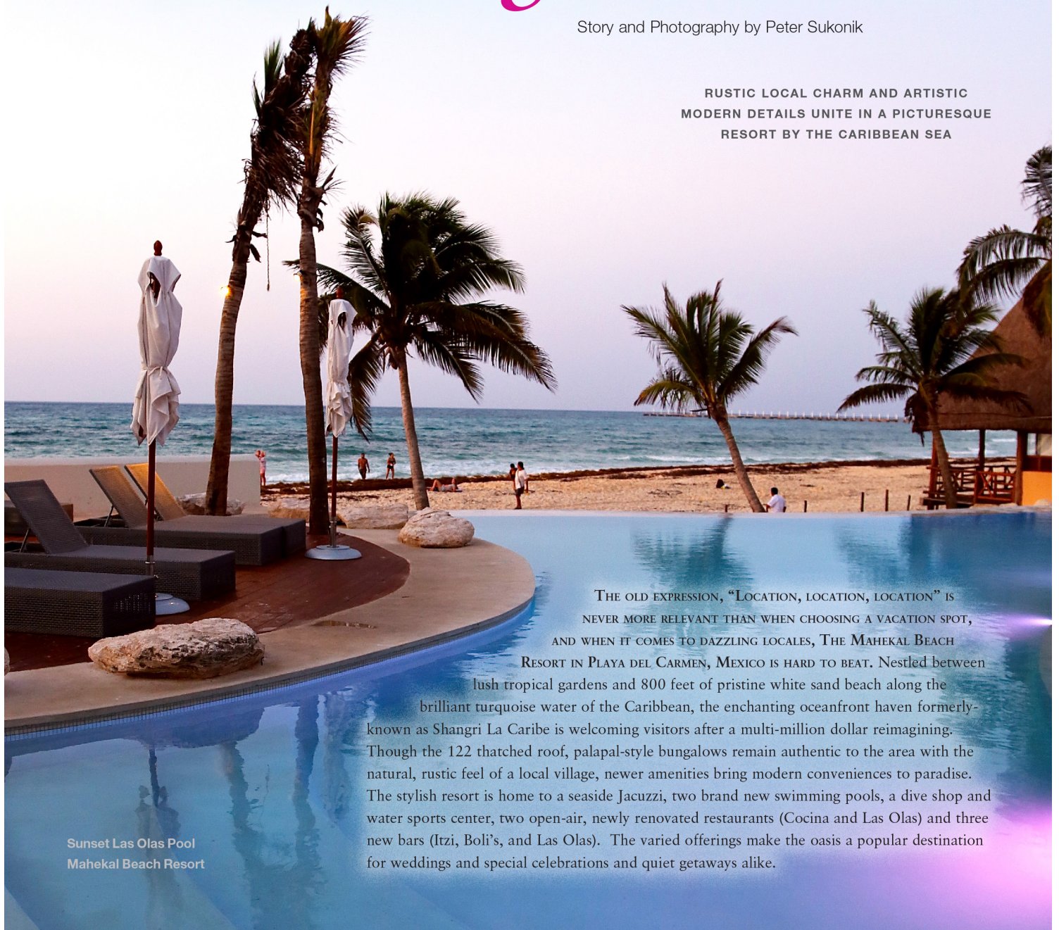
Sunset Las Olas Pool Mahekal Beach Resort

RUSTIC LOCAL CHARM AND ARTISTIC MODERN DETAILS UNITE IN A PICTURESQUE RESORT BY THE CARIBBEAN SEA