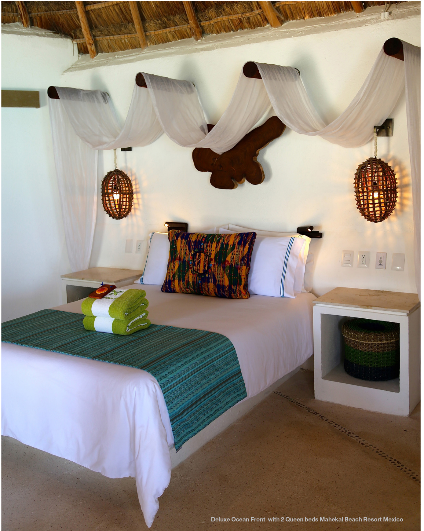
Deluxe Ocean Front with 2 Queen beds Mahekal Beach Resort Mexico