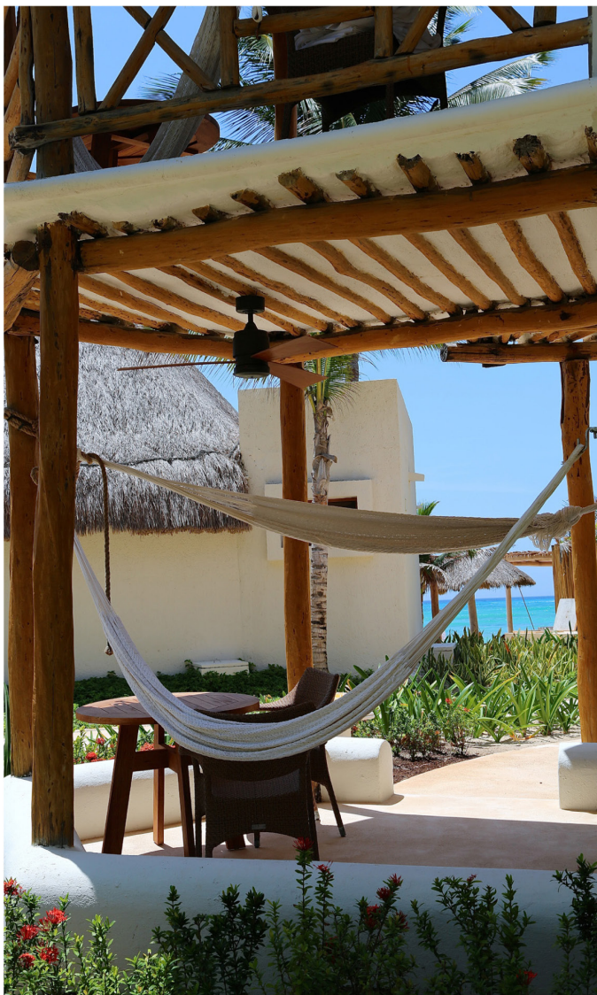
Top Left to Right: Private deck and pool at deluxe oceanfront units; Long shot of Las Olas pool Mahekal Beach Resort; Exotic fare includes Caribbean lobster & hoja santa leaf wrapped in corvina fish, crusted with polenta and Huitlacoche sauce. Left: Hammocks outside bungalow. Below: Castillo (Castle) Tulum Ruins is a popular nearby attraction.