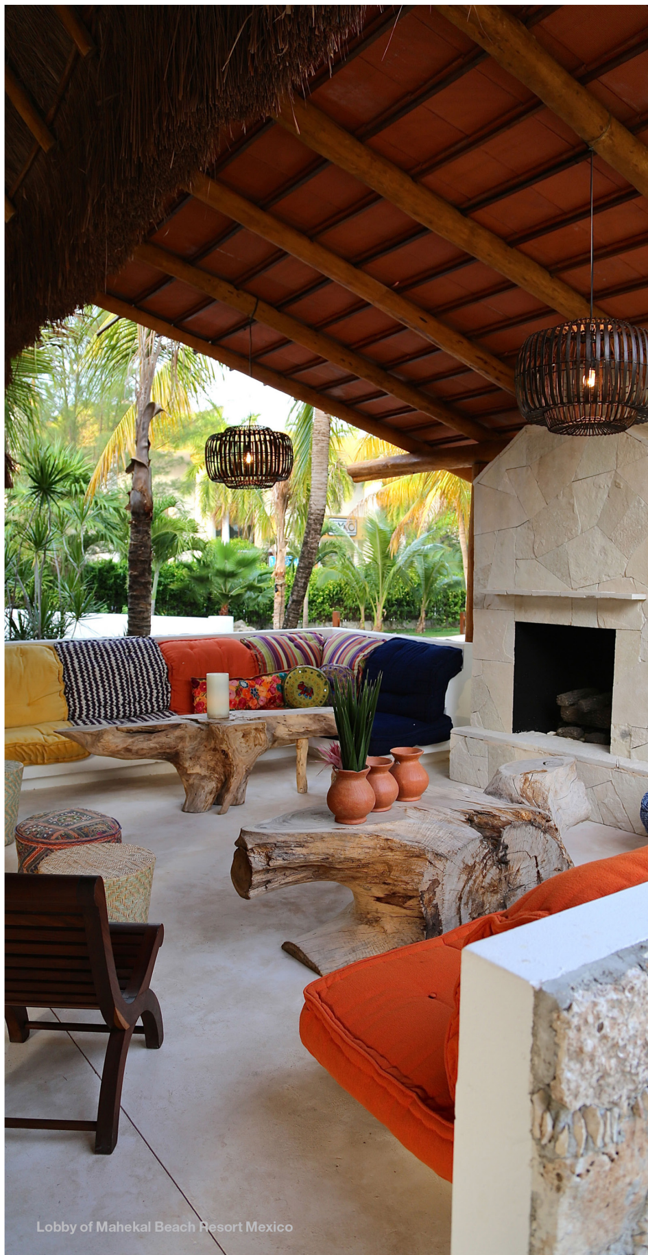
Lobby of Mahekal Beach Resort Mexico

One of the first sights to greet arriving guests is an inviting fireplace seating area in the open-air lobby. Mahekal's bohemian interior design features colorful Mexican accents influenced by the gypsy lifestyle. This bright and eclectic style is evident in the impressive main lobby bar and activity center, where Missoni-esque fabrics are displayed alongside bright orange and cobalt blue ping pong and billiard tables. After check-in visitors can walk through the perfectly manicured grounds and up the hand-laid stone pathways leading to each doorstep. Whether oceanfront or nestled in the Riviera Maya jungle, all bungalows include outdoor terraces with personal hammocks, tempting guests to relax in their own private bohemian retreats. The private, uncrowded beach provides the perfect setting for a barefoot walk, and a convenient jumping off point for snorkeling, diving and refreshing afternoon swims in turquoise waters.