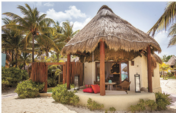
Below: Some of the accommodations sit right on the sand facing the sea.

you can drink. And make a point to stop in at Boli's Bar, named after the hotel's beloved concierge, for a tasty cocktail and game of dominoes, pool or ping pong.