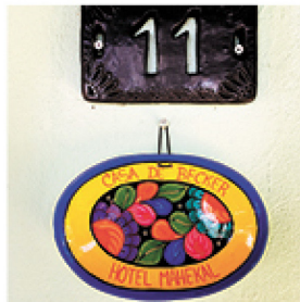
One of the personalized touches that makes a stay at Mahekal so special.

I'd like to say that during the rest of my stay at Mahekal I worked out in the fitness room, but I never quite got up the energy. I didn't take advantage of the spa either, but I did seriously contemplate getting one of the luxurious-sounding, Mayan-inspired treatments. And I