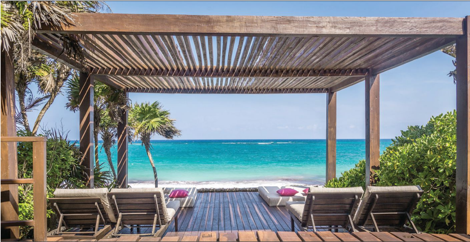
Fresh fish, top, pulled from the waters nearby, provide lunch on the beach. A secluded lounge space at Mezzanine provides an unfettered Caribbean view.