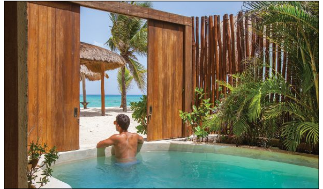
A private suite plunge pool at Mahekal Beach Resort also offers access to the beach.