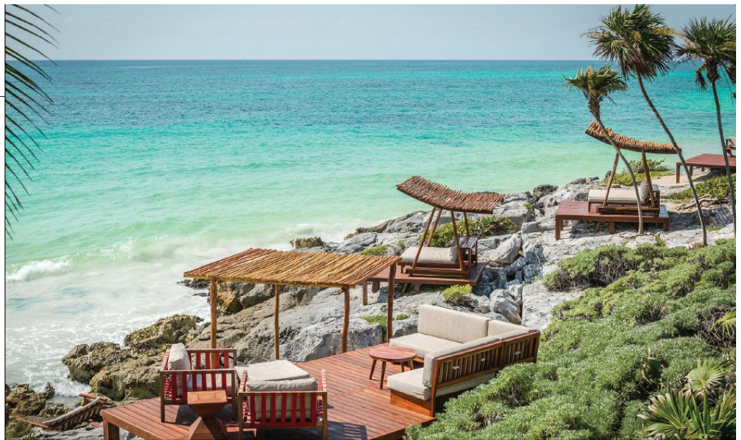
Tulum's adults-only retreat allows you to comfortably settle in above the rocky shoreline and next to the sea. Mahekal Beach Resort in Playa del Carmen, below, provides front row seats on the coast's longest private stretch of sand.

Both hotels make wandering easy, but biologist/guide Manuel Galindo, owner of Bob Manu Tours, brings excitement to narrated tours of the ruins as well as swimming in underground caves called cenotes; he even includes a ceviche lunch on a quiet beach. Otherwise, explore at your own pace via loaner bicycle from either hotel, pedaling a few minutes down the road to take a morning yoga class at Sanará's oceanfront studio; browse the al fresco boutiques selling handmade straw hats, embroidered handbags and flowy frocks; indulge in a Mayan clay massage; and sip a custom-crafted cocktail (you tell the bartender if you like dry or sweet, spicy or herbal) at the Mulberry Project, a seaside bar at La Zebra hotel. Nighttime dining adventures include the chef's table at La Zebra, serving an eight-, 10- or 12-course tasting menu of lovely little dishes from the imagination of chef Eleazar Bonilla; and the ever-changing menu at Hartwood, where everything is cooked over a wood fire and all ingredients are local. Most lovable about Tulum: Each business is self-sustaining, providing its own power, water and other services. Though popularity continues to mushroom, growth is tightly controlled, ensuring that the town remains almost magically low key.