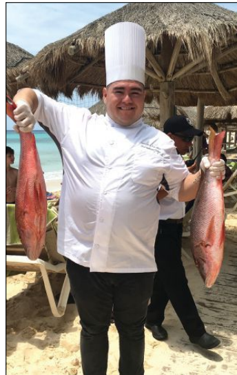
The resort chef poses with the morning's catch in Playa del Carmen; fruit for cocktails in Tulum.