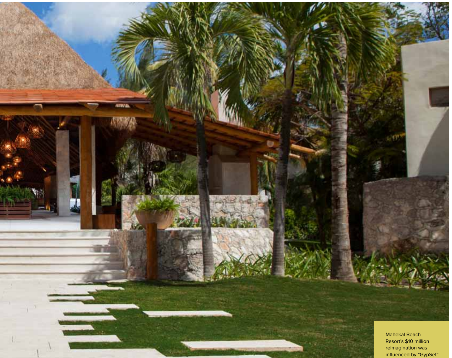
Mahekal Beach Resort's $10 million reimagination was influenced by "GypSet" style; its open-air spaces are at once bohemian-chic and informed by a desire for native authenticity.

beach. That hotel debuted back in 1982 with just six beachfront huts, and, through the years, wove itself into the fabric of a burgeoning Playa del Carmen.